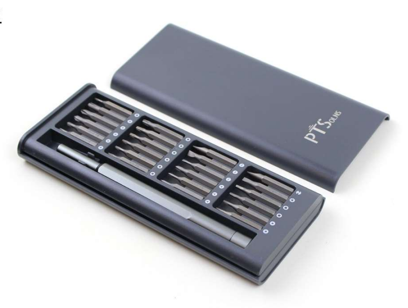
Figure 2: Identification of the 24 bits.